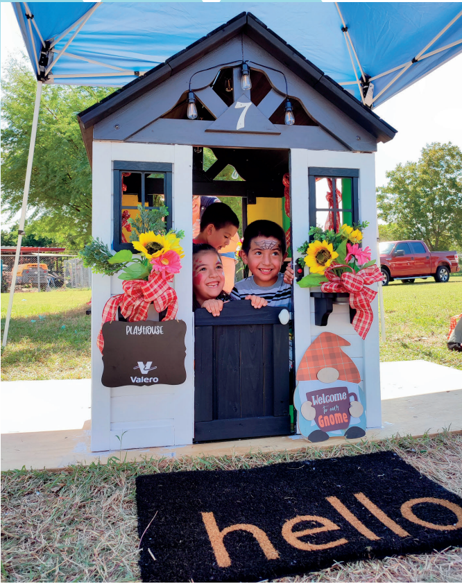
PROJECT PLAYHOUSE 2022