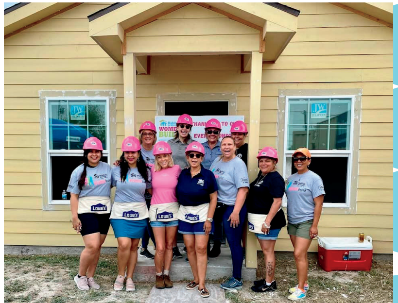
WOMEN BUILD 2022